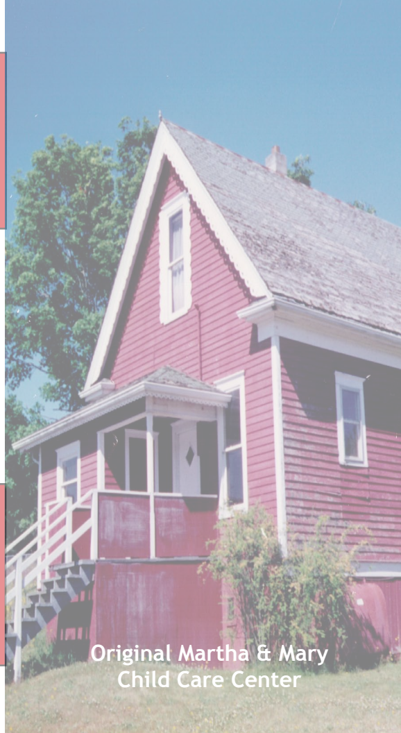
Original Martha & Mary Child Care Center

Research shows that unsupervised children, left alone after school, are more likely to be involved in juvenile misdeeds and have less access to creative outlets.