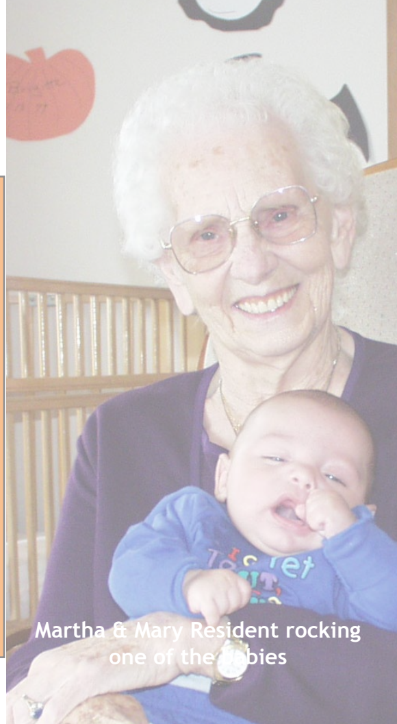
Martha & Mary Resident rocking one of the babies

The earnings from the trust will be distributed annually to Martha & Mary to help enhance the lives of women living at the Health & Rehab Center.