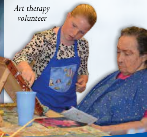
Art therapy volunteer

A Wish for a Safe, Affordable Place to call my own.