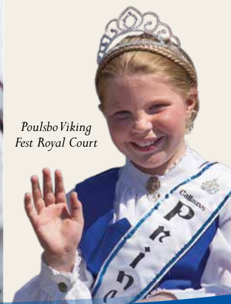
Poulsbo Viking Fest Royal Court

One young girl's journey at Martha & Mary is not unique. M&M offers help to those who need it at any age—and those we've helped often become the helpers. Ours is a community of caring for families... for generations. ❤️